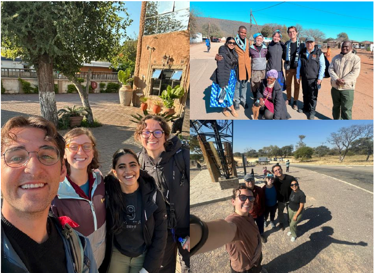
(clockwise) The group in Gabarone, at the Kgotla, and at the Tropic of Capricorn